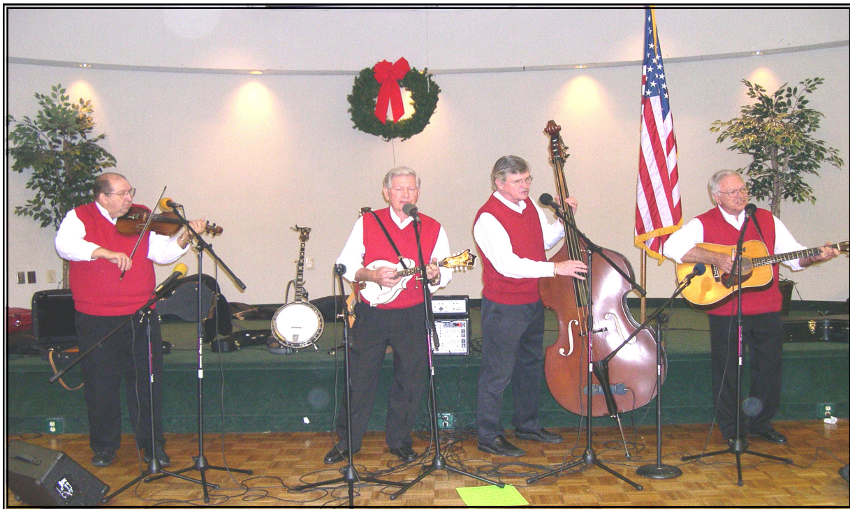
A medley of patriotic, bluegrass, country and Christmas songs was provided by The Bluegrass Tarheels Band during the quarterly 'eating meeting'