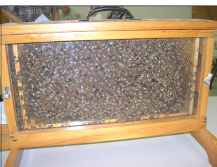
Live honey bees in frame

Treasurer's Report: Shirley Moser; Copies of the Treasurer's report were distributed to the members prior to the meeting. Balance of funds on hand since last report, $907.48; Receipts: $239.88; Disbursements: $100.00; Total to be Accounted For: $1,047.36; Total Obligations: $40.00; Balance on hand for use: $1,007.36. The Treasurer's report was filed for audit.